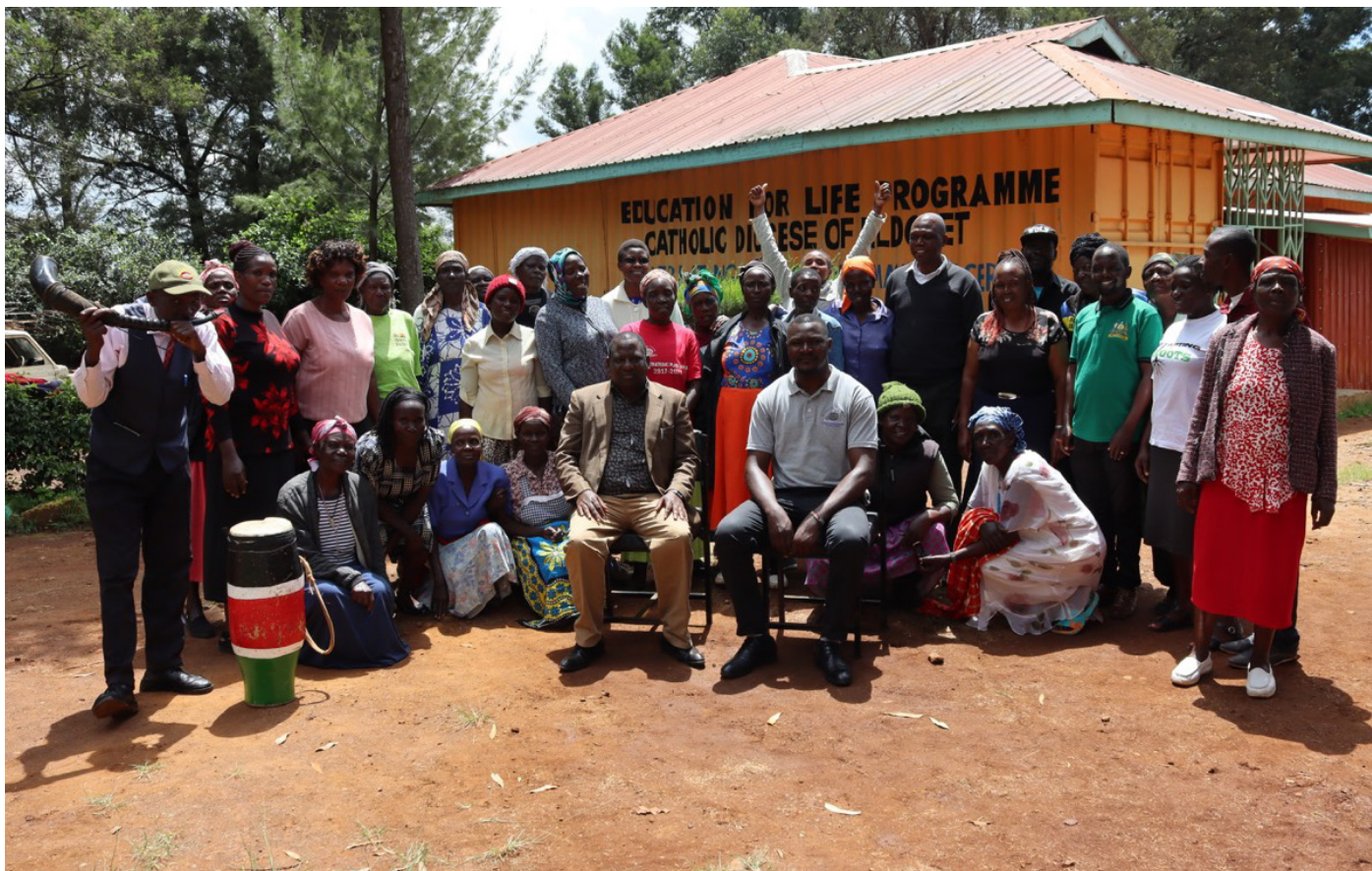
Participants in the Education for Life Economic Empowerment Project in Eldoret, Kenya