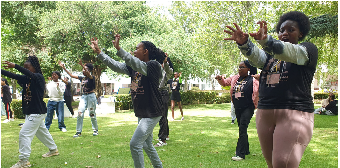
Beneficiaries of the Mbokodo project at the Justice Desk Africa participating in self-defence classes, South Africa