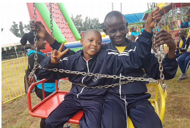
Children from the Mary Rice Centre enjoying their school outing

To celebrate the end of term, the children and staff at Mary Rice Centre Kenya enjoyed a fun outing at a local park. Both the children and staff enjoyed a picnic and lots of games and activities to mark the occasion.