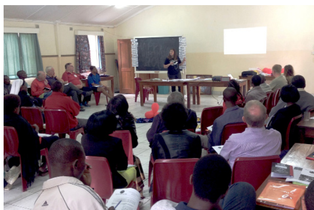
Advocacy Workshop at the Pastoral Centre in Limulunga, Western Zambia