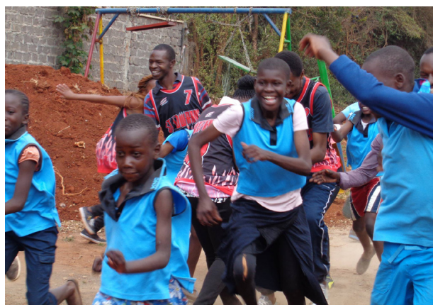
Leaders and participants enjoying the Karibu camp

Later in the month, 33 camp leaders visited eight informal schools in Kibera as part of their community outreach program. The theme of the day was “newness and new possibilities, being positive even with disappointments.” This being the last term in the calendar year, the leaders focused their questions and discussions with the students on the children’s growth and development, academic success and their educational goals. The leaders were able to debrief after the outreach day and plan for future recruitment of volunteers and camp leaders.