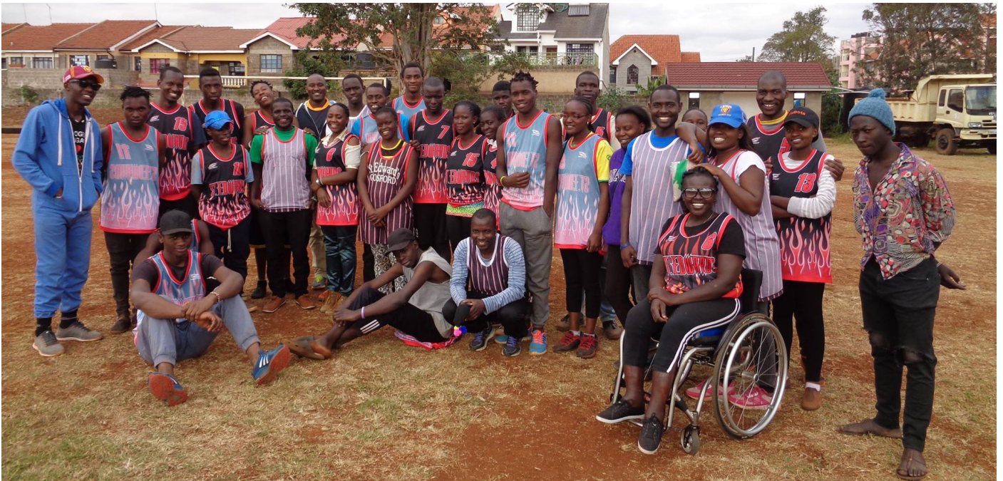
Leaders and participants enjoying the recent Edmund Rice Karibu Camp, Kenya

Welcome to the first Edmund Rice Development Newsletter of 2018.