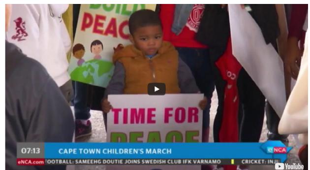
The Peace March was covered by several South African news outlets, including the eNCA network

police station in the area; and to begin lobbying provincial SAPS in order to build a new police station in the community. After many years of lobbying and fighting for the rights of this community, progress is being made.