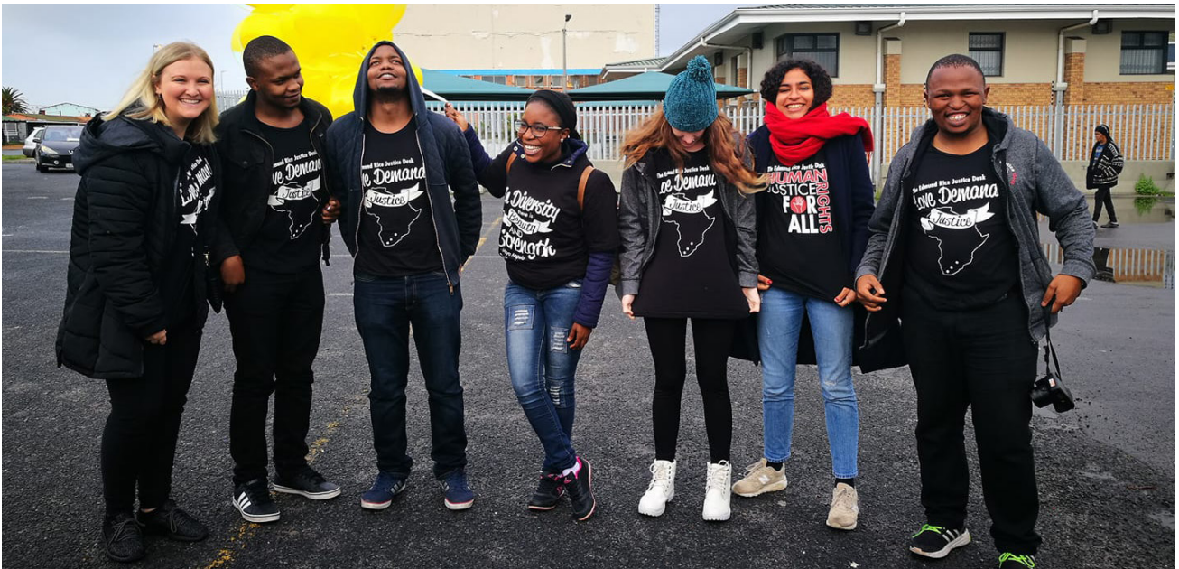
The Edmund Rice Justice Desk team ready for the Bonteheuwel Peace March

On the 30th of June, the Edmund Rice Justice Desk led a community march through Bonteheuwel protesting ongoing gang violence in the Western Cape. During the march, shots could be heard in the area, highlighting the urgent need for change. In October last year, 66 child murders were recorded in the area.