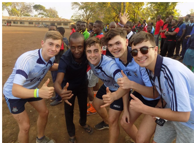
St Aidan's CBS students before the football match against Sinon Secondary School

Eleven months later, Immersion 2017 is complete. The trip of a lifetime is complete. It still has not sunk in. The most amazing experience we've ever had is over. On Friday, 27th of October, eighteen students and four teachers set off for Tanzania in Eastern Africa. Emotions were running high as we all began to speculate about what exactly this foreign land would be like. The reality of our visit was beyond any of our expectations.