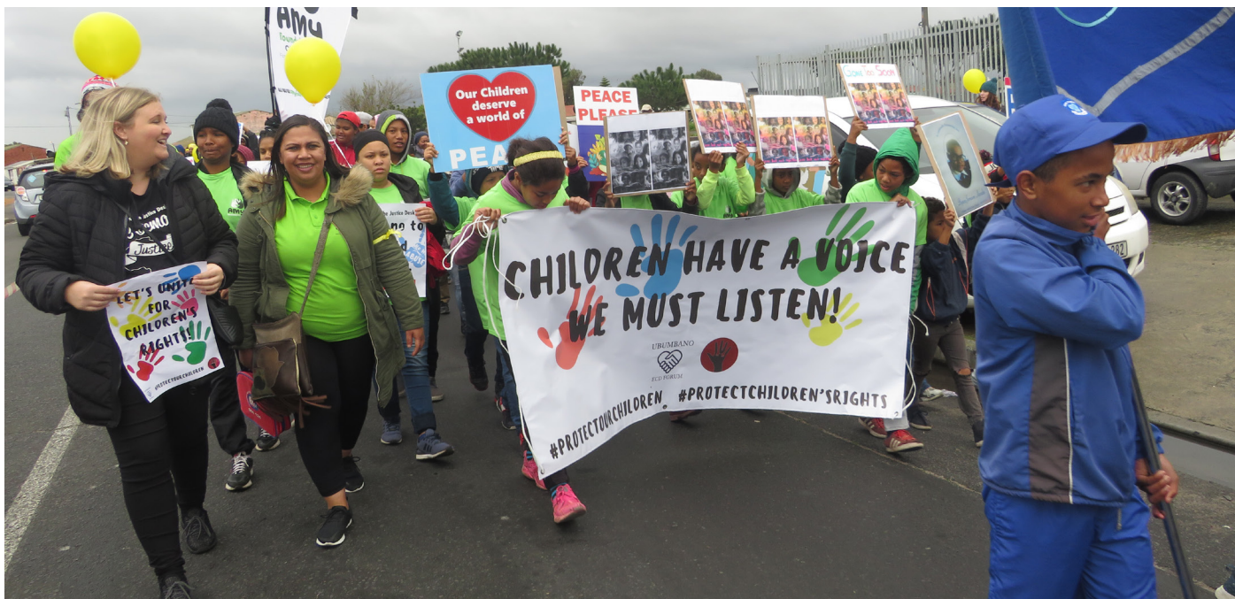
The Edmund Rice Justice Desk leading the Bontenewel Peace March protesting gang violence in the Western Cape, South Africa

Welcome to the second Edmund Rice Development Newsletter of 2018.