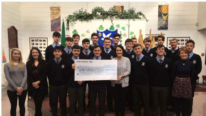
St. Aidan's CBS students and teachers presenting cheque to Edmund Rice Development