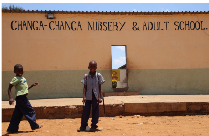
Pupils outside of Changa Changa School, Zambia

Changa Changa School is a primary school serving the Changa Changa residential compound in the Mazabuka community of Zambia. ERD donors and supporters have been supporting Changa Changa School since 2009, and have contributed to developing basic infrastructure, including classrooms, a computer laboratory, a staff room and toilets, as well as providing teaching and learning materials. The improved school learning environment has contributed to the pupils' academic performance greatly improving. The school Grade 7 examinations' results now stand at 97% pass rate and Changa Changa School has become one of the top 5 schools in Mazabuka district.