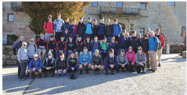
The group during their Camino experience.

"As Catholic schools in the Edmund Rice tradition the trip was a pilgrimage - not merely a walking tour. Our Camino intentions and plans were mindful of the various characteristics of the Jubilee Year of Mercy as proclaimed by Pope Francis. It took place during Holy Week and included elements of prayer, spiritual reflection and/or liturgical celebration each day and concluded with our participation in the Easter Vigil Mass in Santiago on Holy Saturday night. Significantly, the Camino event gave witness to the vision that inspired the establishment of EREBB including: sharing identity, partnership, collaboration, networking and gospel centered formation. It was a wonderful example of the blending together of two Edmund Rice schools for a common purpose. We quickly became a unified group of students and staff bound by our identity, by friendship, co-operation and solidarity with each other in the spirit and the charism of Blessed Edmund Rice."