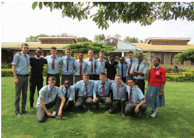
St. Aidan's CBS and Edmund Rice Sinon Secondary School students.