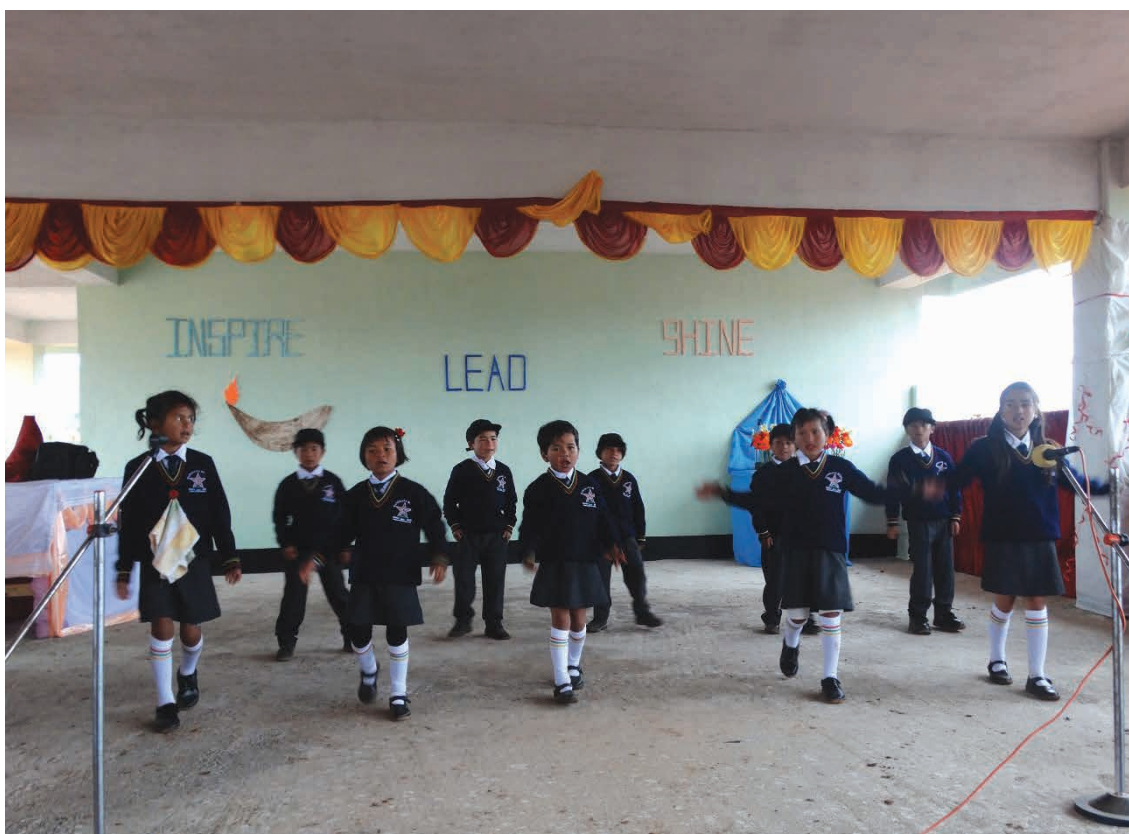
Children performing at inauguration of opening of a new school building in Wahrinong.