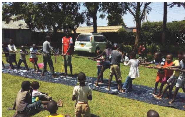
Edmund Rice Camps, Eldoret, Kenya.

Edmund Rice camps in Eldoret and Kibera in Kenya are a place for children from disadvantaged backgrounds to have fun through sports and games, and through these to develop their confidence and self-esteem and build new friendships.