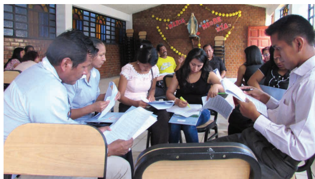
Group discussion during a Child protection workshop.