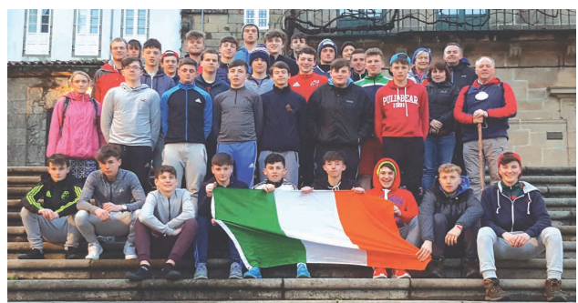
Midleton CBS and Ardscoil Rís proudly fly the Irish flag in Spain.