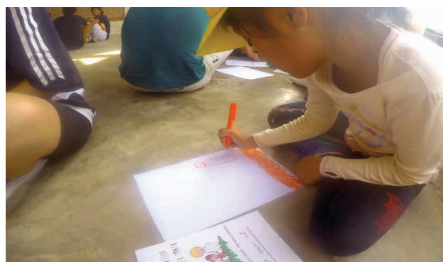
Workshop participant in the Omas community.

The workshops were possible thanks to Christian Brothers who provided educational material to guide and educate the community – they were kindly funded by Edmund Rice Development and Misan Cara.