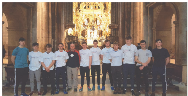
Pupils and Staff from Midleton CBS and Ardscoil Rís on their Camino journey.