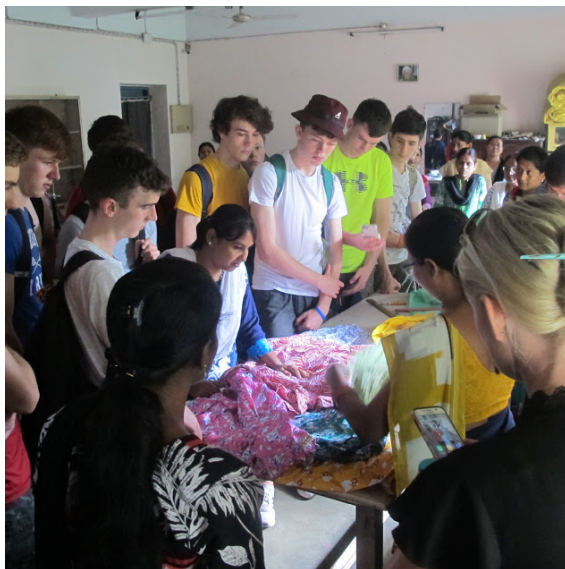
Pupils from Ardscoil Rís visiting St. Vincent's Technical School

Ardscoil Rís in Limerick and Ardscoil Na Mara in Tramore have both generously raised funds for Edmund Rice Mission projects in India. These funds are currently supporting two projects in need of funding especially in the context of COVID-19.