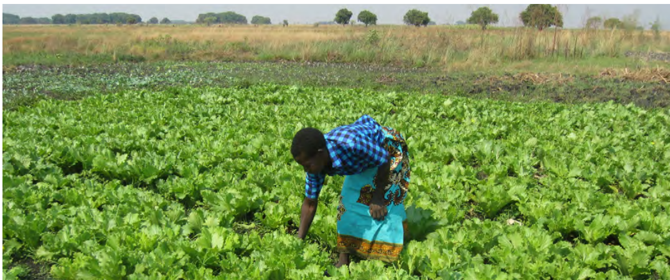
Female Beneficiary in the Western Cluster project, Zambia