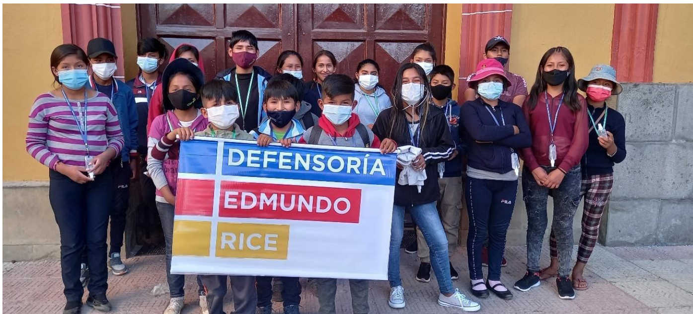
Pupils from Cochabamba, Bolivia taking part in a Defensoría Edmundo Rice workshop on Human Rights organised by the local coordinator.