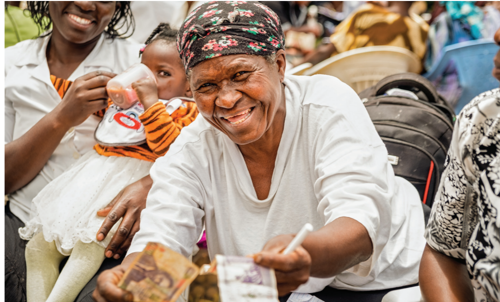
Pictured: Participant in the Education for Life programme, Kenya

Please do not add me to your mailing list