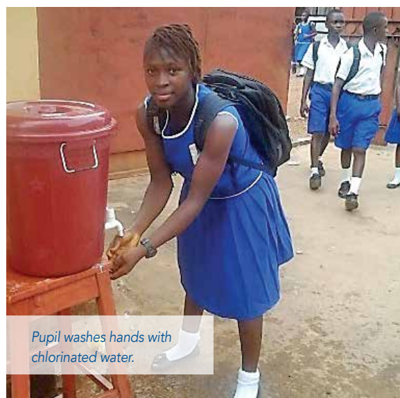
Pupil washes hands with chlorinated water.