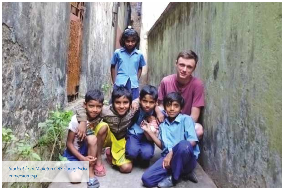
Student from Midleton CBS during India immersion trip