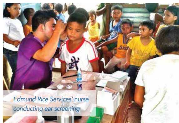
Edmund Rice Services' nurse conducting ear screening

Merci-action: the Edmund Rice Services mobile team also provided support to the poorest people living in the area who are affected by severe or critical health issues. The team provided financial assistance and support, such as medical and surgical intervention and provision of prescription medications etc.