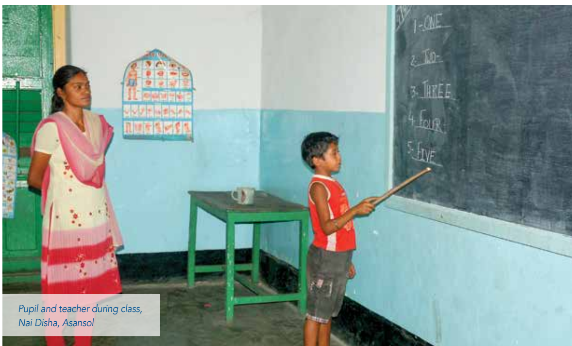
Pupil and teacher during class, Nai Disha, Asansol

In 2014, private donors generously donated €13,000 for St. Mary's Orphanage and Day School to pay for teachers' salaries, purchase sporting equipment and educational materials and pay for exam fees for 50 students.