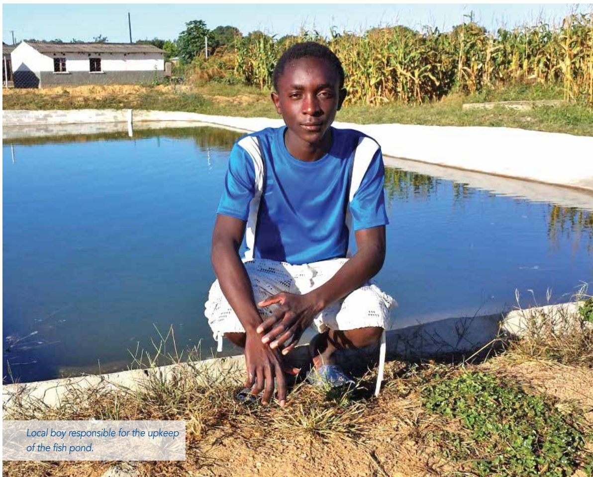
Local boy responsible for the upkeep of the fish pond.

A chicken house was also built in the grounds of the Centre as part of the income generation activities. The house holds approximately 450 chicks.