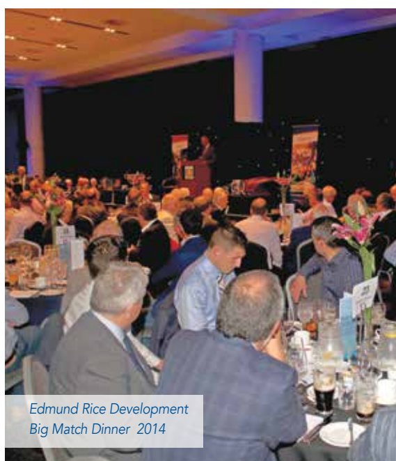
Edmund Rice Development Big Match Dinner 2014