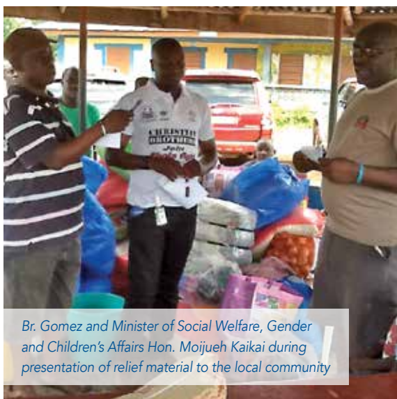
Br. Gomez and Minister of Social Welfare, Gender and Children’s Affairs Hon. Mojueh Kaikai during presentation of relief material to the local community

“We never had any mechanism in place for such an invincible and merciless virus. . . The situation is still not under control. It is too big for government to handle we need to step up.” CHRISTIAN BROTHERS IN SIERRA LEONE, SEPTEMBER 2014