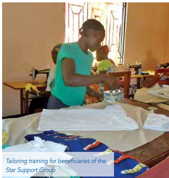
Tailoring training for beneficiaries of the Star Support Group