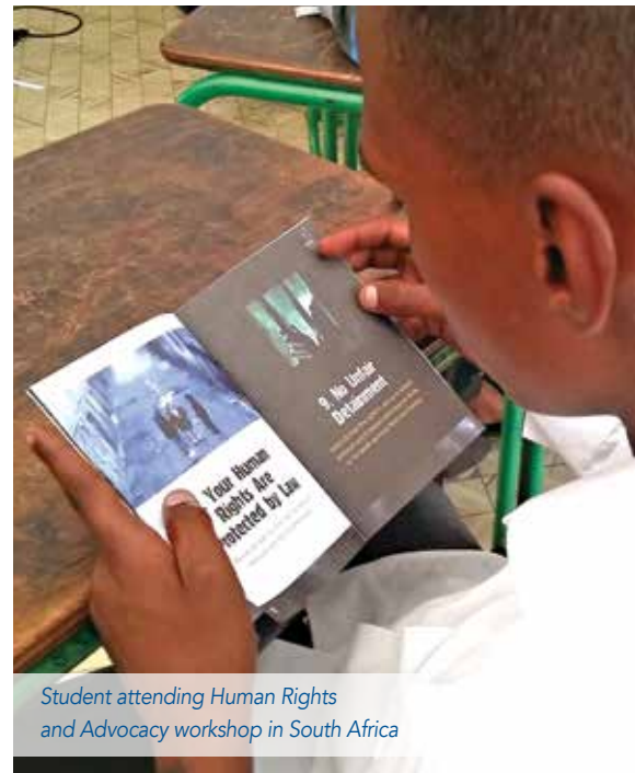
Student attending Human Rights and Advocacy workshop in South Africa

In 2014, Edmund Rice Development sourced a grant of €70,099 from Misesan Cara for Edmund Rice Camps, South Africa to run camps over 12 months to develop and enhance the self-esteem of vulnerable and marginalised children and youths and enhance the leadership skills of young adult volunteers, as well to purchase new equipment and transport for the children.