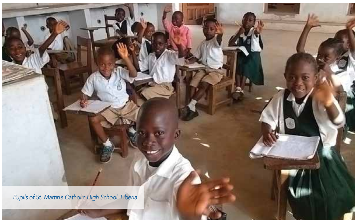
Pupils of St. Martin's Catholic High School, Liberia