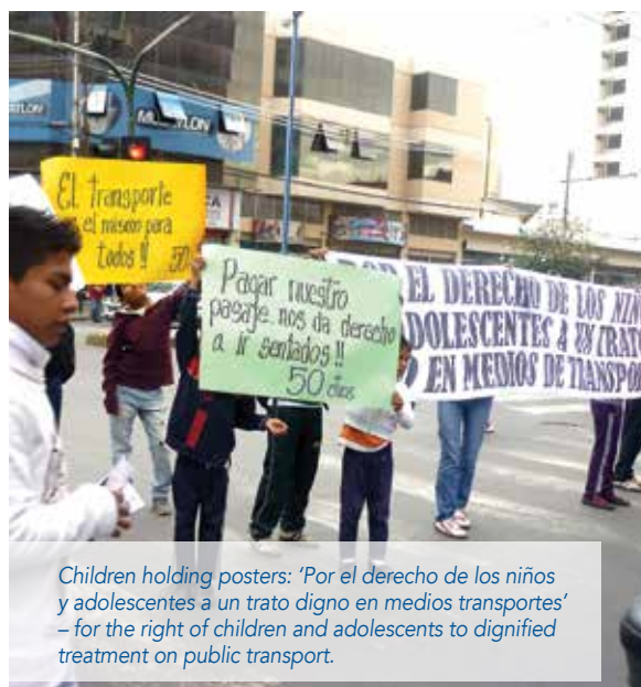
Children holding posters: 'Por el derecho de los niños y adolescentes a un trato digno en medios transportes' – for the right of children and adolescents to dignified treatment on public transport.

The Hermano Manolo Centre also advocates and supports working children to advocate for themselves and campaign for fair treatment. On Friday 23rd May, for example, three groups including a group from the Centre, came together to hold a peaceful demonstration to protest against children being over-charged on public transport and the abuse and unfair treatment by drivers.