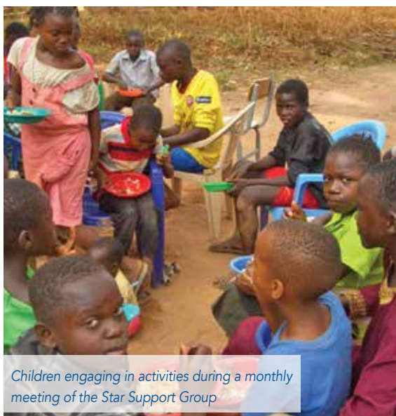
Children engaging in activities during a monthly meeting of the Star Support Group

In 2014, Edmund Rice Development sourced funding from private donors to provide nutritional support for orphans and vulnerable children. In addition, recent funding also contributed to the eagerly-awaited tailoring project, which opened in 2014, helping members to gain sewing and tailoring skills. The first phase is currently enabling 30 beneficiaries to undertake training. In turn it allows trained individual to sustain themselves by producing and selling tailored items: this is one way in which the project is striving to become self-reliant.