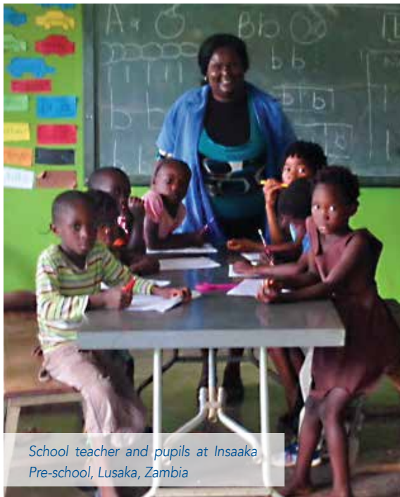
School teacher and pupils at Insaaka Pre-school, Lusaka, Zambia

In 2014, Edmund Rice Development sourced a grant of €2,000 from the Christian Brothers Edmund Rice Trust and €2,400 from private donors to pay a teacher's salary for one year and to purchase school uniforms, materials and foods for pupils. Thanks to the basic education pupils receive in Insaaka, they are in position to undertake the aptitude test for the local government school, enroll in first level education and start their journey out of poverty.