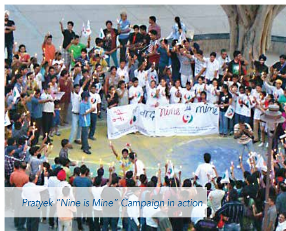
Pratyek "Nine is Mine" Campaign in action

The organization attempts to educate both children, and those who care for them, in the practices of advocacy and social justice with a special focus on child rights and earth rights. It does this by ensuring social justice is included in schools curricula and by partaking in Human Rights events. Pratyek recognizes children as primary stakeholders of society, and seeks to provide them with a voice and representation on a number of local, national and international forums and platforms. This gives them the opportunity of being represented in the policy-making process. Pratyek teaches children to advocate for themselves: the group has taken on a number of high level projects such as a trip to the United Nations in New York to speak to delegates about the rights of marginalised children in India.