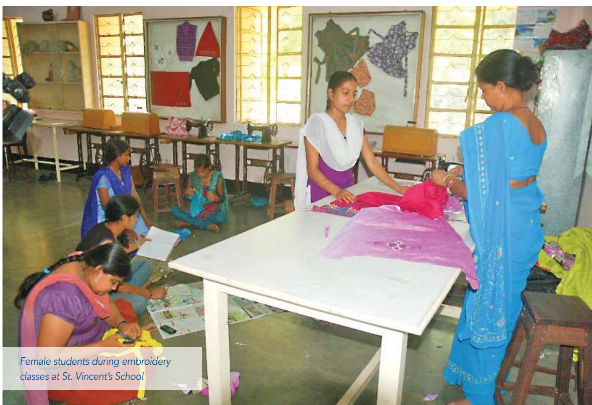
Female students during embroidery classes at St. Vincent's School

In 2014, Edmund Rice Development sourced a grant of €11,000 from private donors to pay the English teacher and women's co-ordinator salary, hostel fees to allow students from far flung villages to attend skills training and provide equipment and meals for students attending the Two Wheeler Repair Course.