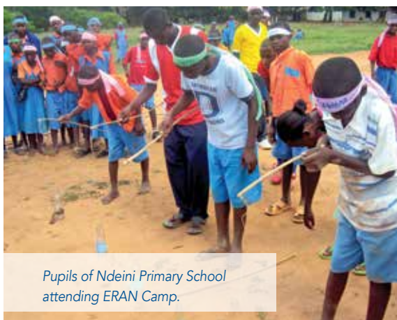
Pupils of Ndeini Primary School attending ERAN Camp.

"Most of the trainings facilitated by ERAN have empowered us with skills, tools and courage to claim our rights through advocacy. We feel that in as long as we are fighting for the community rights, we do not have to be afraid or keep quiet. Through these efforts, we have seen many positive changes such as the construction of a pit latrine for our pupils in school through the Constituency Development Fund. We have also received equipment to start a village vocational training school from the County government and have received "promises" that the school shall be connected to the national electricity grid after we had approached the county government. I am forever grateful for the way ERAN has opened our eyes."