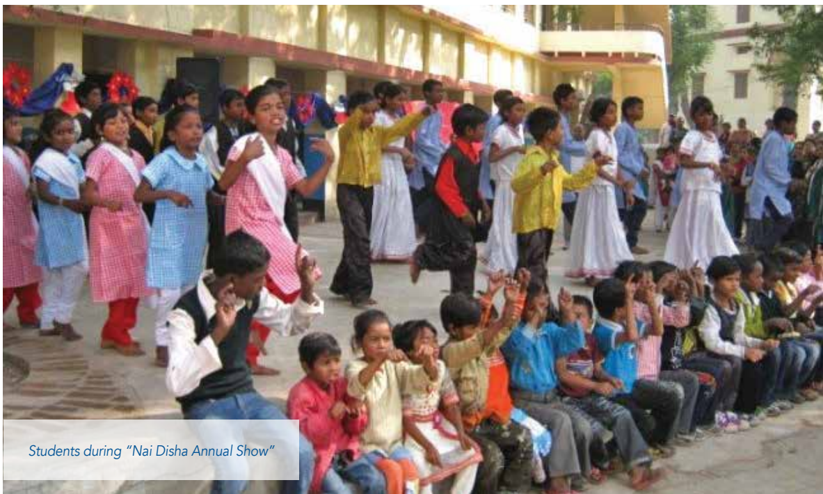
Students during "Nai Disha Annual Show"

In 2014, private donors generously donated €7,000 to purchase audio visual and IT equipment, six sewing machines and various other sporting and teaching equipment and materials.