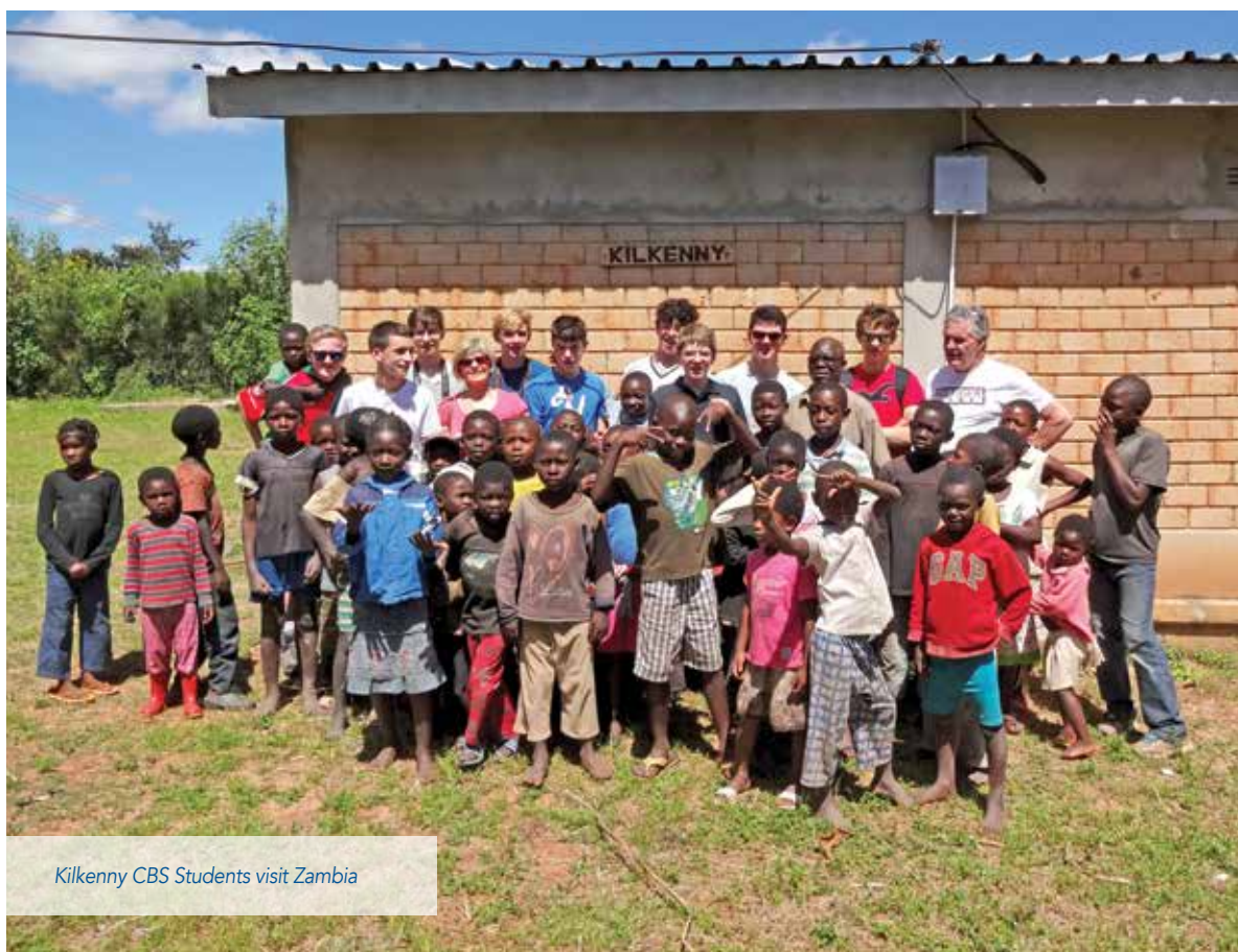
Kilkenny CBS Students visit Zambia

As we travelled around to each project in two pick-up trucks, we got the opportunity to appreciate the beautiful country of Zambia, full of smiling children, sunshine and towns and villages lined with stalls of fresh tomatoes and melons. Unfortunately there were also harsh lessons to be learned about the reality of life for the Zambian people and their struggle with Aids and access to schools. Without a doubt, the highlight of the trip for me was meeting the children. Anywhere we went, we were surrounded by children who seemed so happy despite having almost nothing, and many also suffering from Aids.'