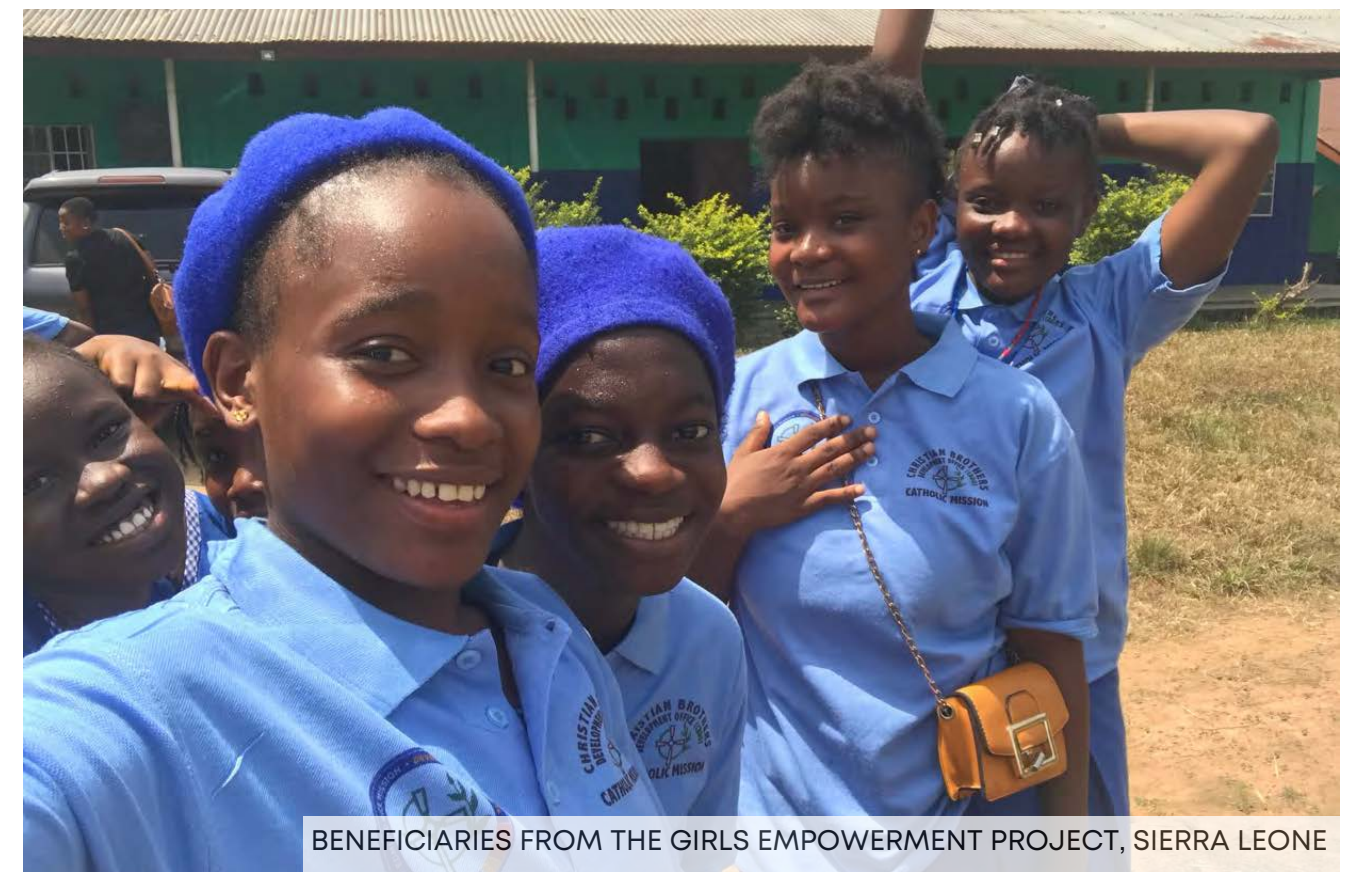
BENEFICIARIES FROM THE GIRLS EMPOWERMENT PROJECT, SIERRA LEONE