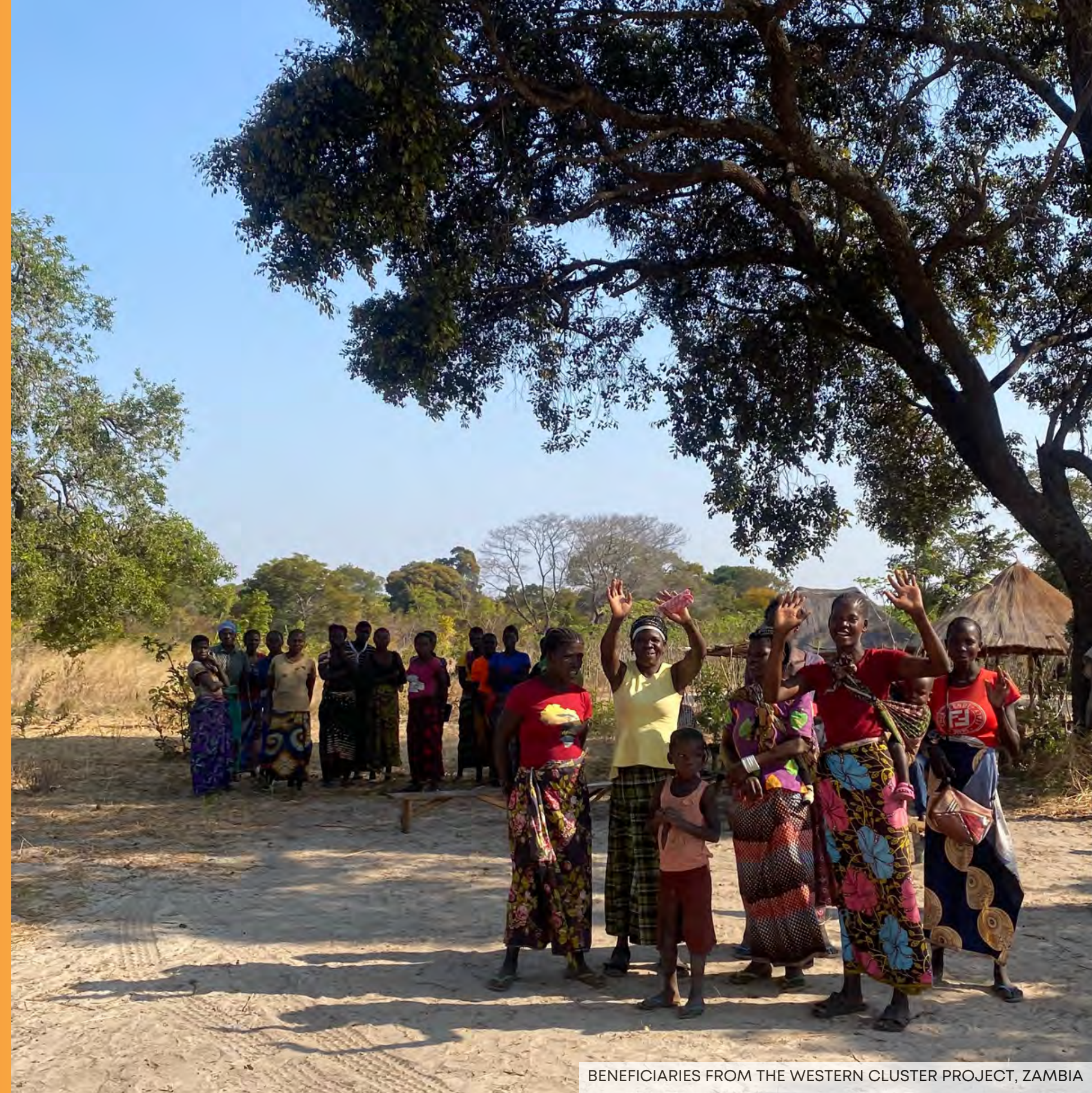
BENEFICIARIES FROM THE WESTERN CLUSTER PROJECT, ZAMBIA