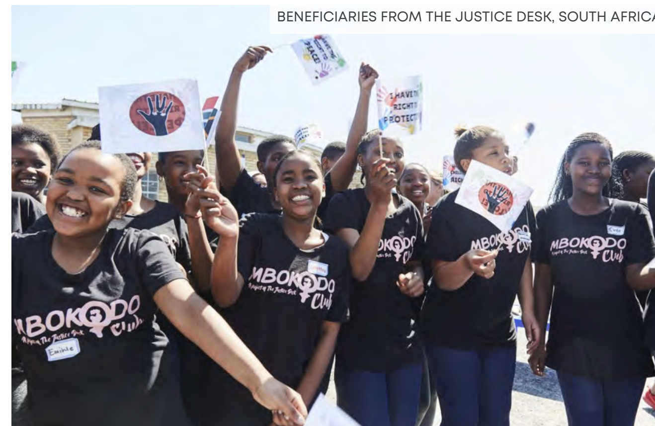
BENEFICIARIES FROM THE JUSTICE DESK, SOUTH AFRICA