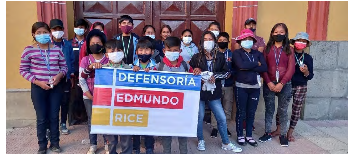
BENEFICIARIES FROM DEFENSORÍA EDMUNDO RICE PROJECT, BOLIVIA