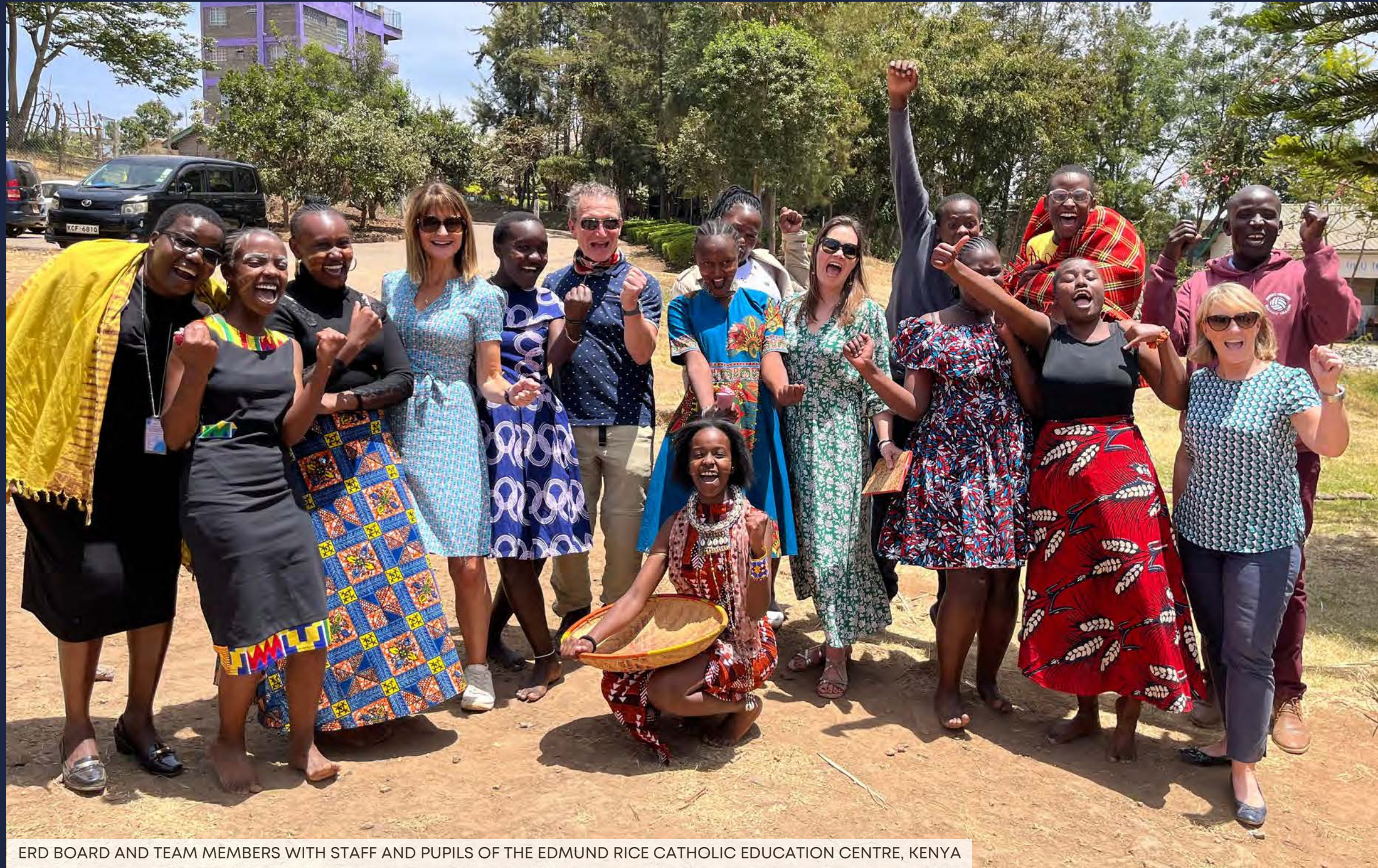
ERD BOARD AND TEAM MEMBERS WITH STAFF AND PUPILS OF THE EDMUND RICE CATHOLIC EDUCATION CENTRE, KENYA